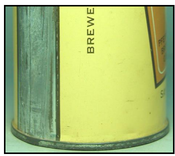
MBC 63-36.3 No canning info shown