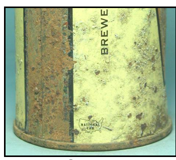
MBC 63-36.2 National Can Company