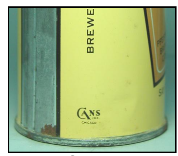
MBC 63-36.1 Cans Inc, Chicago

Perhaps Pfeiffer's relationship with American Can Company didn't last, they didn't immediately switch back to American after their short run with Continental's blue pants, or they simply started producing so much beer in their basic design that they needed other can companies to keep them supplied. For our last three <u>blue</u> pants, <u>black</u> shoes variations we have MBC 63-36.1 from Cans Inc, MBC 63-36.2 from the National Can Company, and MBC 63-36.3 which has no canning info at all.