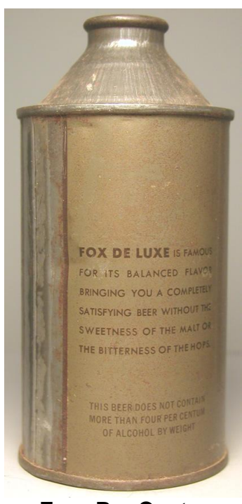
Four Per Centum